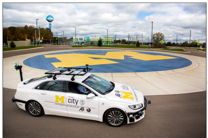
Mcity and Testing CAV

Two examples of testing scenarios that can be designed within this framework are railway crossing and red light running. In the railway crossing scenario, a virtual train is generated in VISSIM when the testing CAV is approaching a rail crossing located in Mcity. The testing CAV should stop before the rail-crossing and wait for the train as shown in the photo. The photo shows the views from both simulation and the real world. A blue train is generated and traveling on the track in the left part of the figure